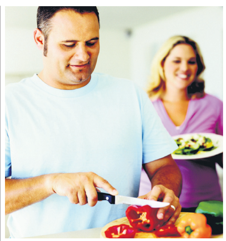
While most of us have good intentions about following Canada's Food Guide, many people have a tough time regularly incorporating healthy habits into their daily lives.